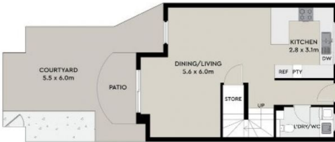
GROUND FLOOR ON SITE PLAN