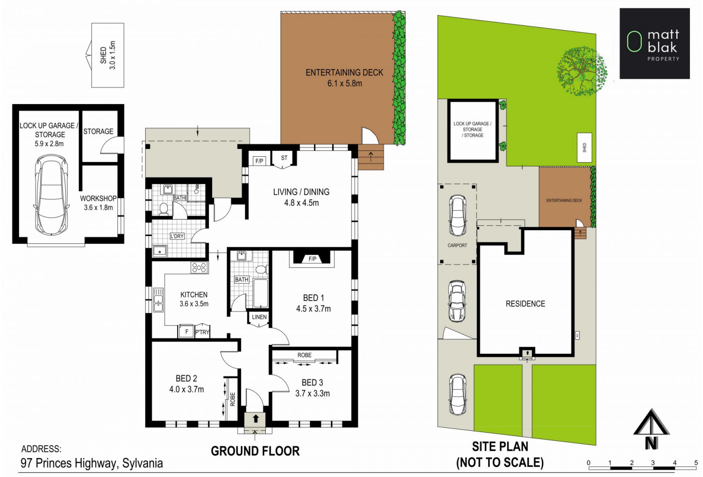
DISCLAIMER: THIS IS FOR ILLUSTRATIVE PURPOSES ONLY, ALL DIMENSIONS ARE APPROXIMATE AND IT DOES NOT CONSTITUTE PART OF ANY LEGAL DOCUMENTS.